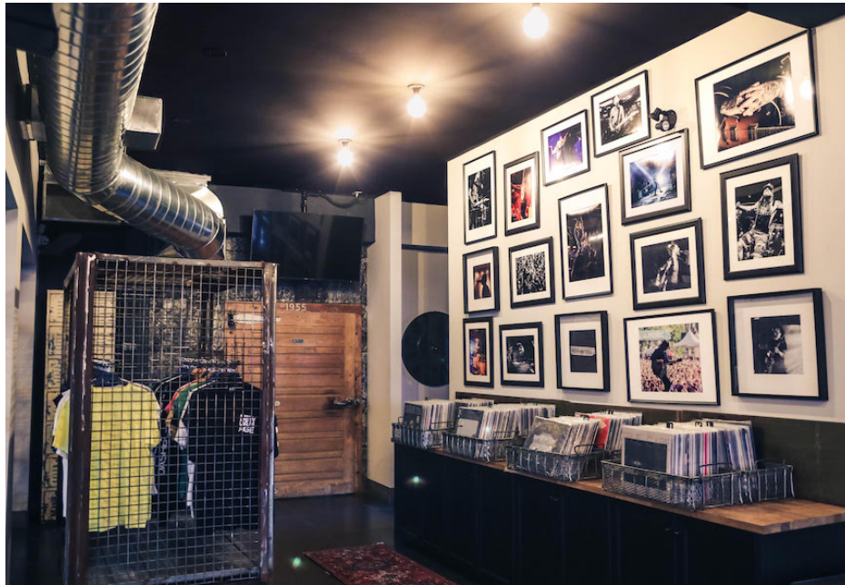
Link to hi-res photo above: http://bit.ly/2FaZaya

One of the top independent labels boasting major industry awards and accolades, Dine Alone opened its doors to the public for the first time for RSD on April 21, resulting in long line-ups around the block , and a nod from NOW Magazine as one of the five best Record Store Day events of 2018.